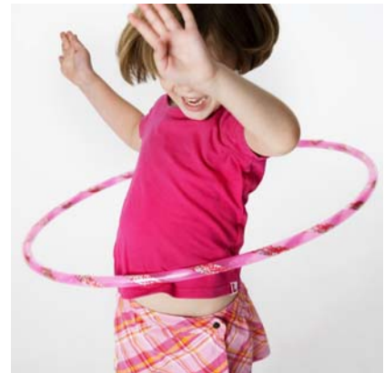
Enjoy the summer!

We hope to be able to welcome you all back to school on August 26 th at our Eat and Greet Ice Cream celebration.