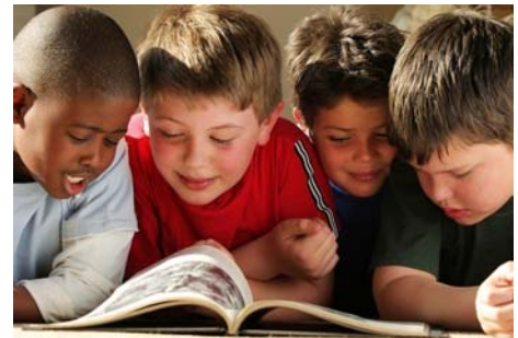
Have a wonderful summer!

Sandown Town Library: The Sandown Public Library always offers a summer program for school aged children. This year’s theme is: 'Summertime...and the READING is easy!' For specifics, contact the library at 887-3428.